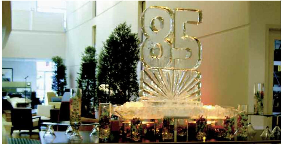
85th anniversary celebration ice carving with fresh shrimptini appetizers