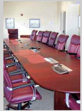
High tech conference room