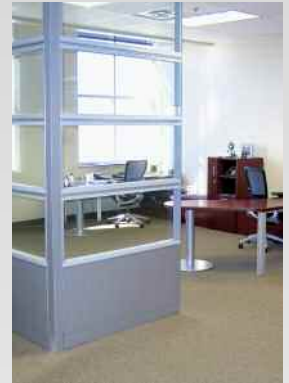
Glass framed work area