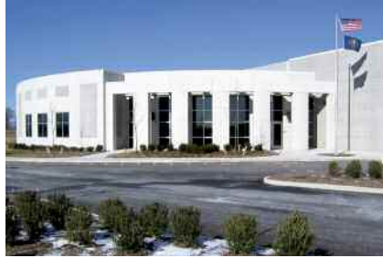
Perkins Logistics headquarters

Since multiple vendors were used, communications were an integral part of the