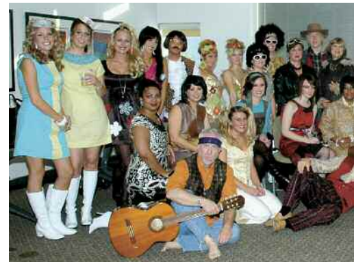
The cast poses before a glamorous evening on the run