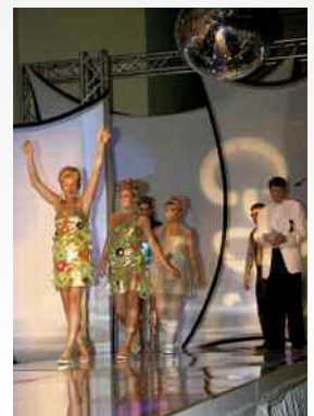
The fashion show models stroll the runway